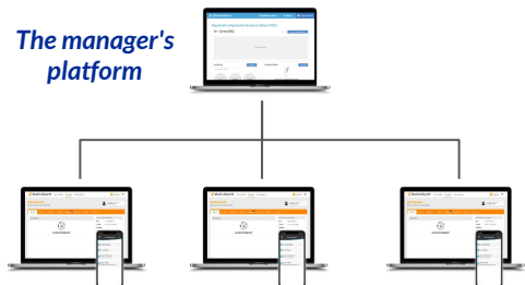
Platforms for individual coaches and their teams